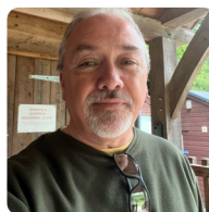
Nick Forest School