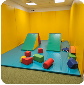
Soft Play Room