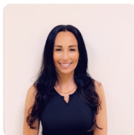
Georgia Learning Support Admin